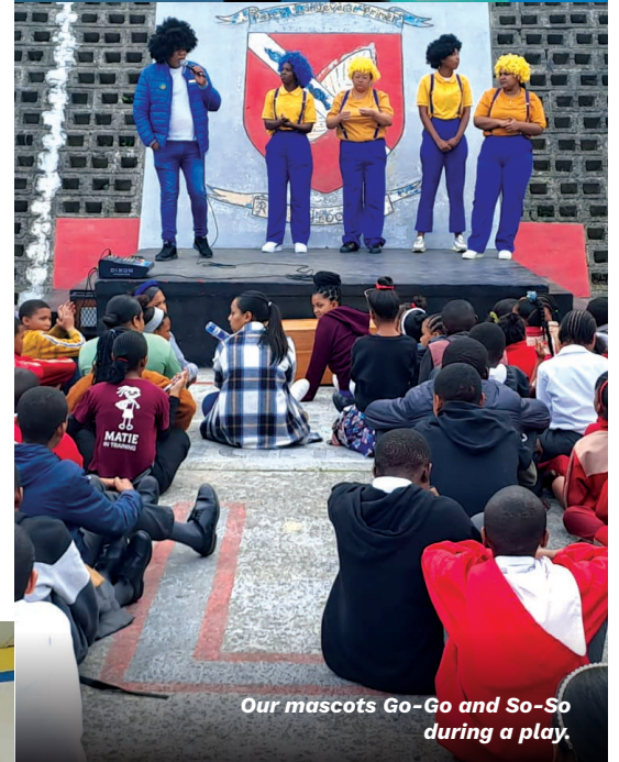
Our mascots Go-Go and So-So during a play.