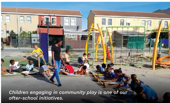
Children engaging in community play is one of our after-school initiatives.