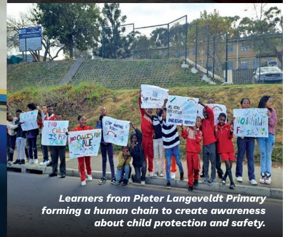
Learners from Pieter Langeveldt Primary forming a human chain to create awareness about child protection and safety.