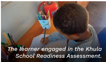
The learner engaged in the Khula School Readiness Assessment.