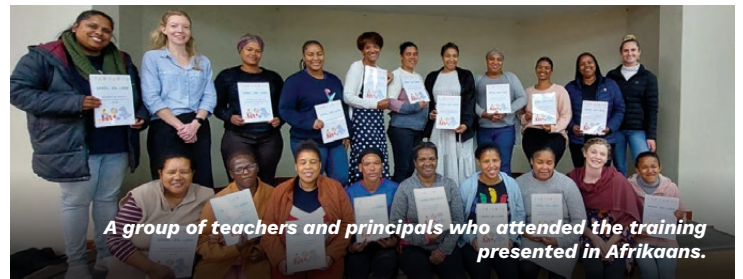
A group of teachers and principals who attended the training presented in Afrikaans.

From April to May 2024, we teamed up with Inceba Trust to deliver our Play and Learn training to one hundred and seventeen teachers and principals from Early Childhood Development Centres. Our Occupational Therapists curated a manual filled with tips and tricks to help children overcome obstacles. Through engaging activities, attendees had a blast while soaking up valuable knowledge.